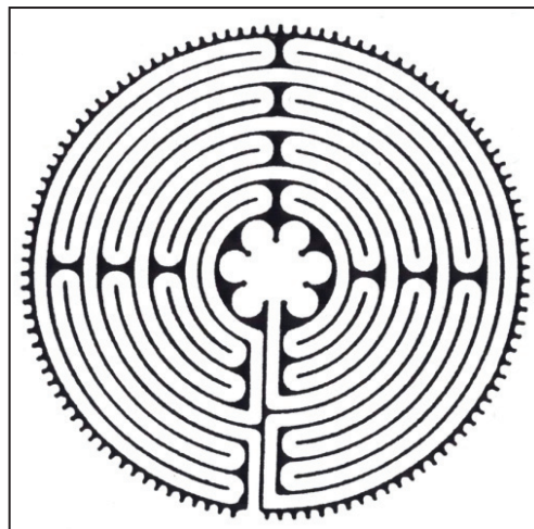
Figure 1. Pattern of the Chartres Labyrinth

Labyrinth walking may offer a much more suitable form of meditation that can potentially lower stress, similar to mindfulness meditation (Ciancosi, 2002). Walking a labyrinth does not require weekly group classes or the need, necessarily for a trained instructor. Employees need only to schedule 10 to 15 minutes for their personal walk and, although each person is walking individually, numerous people can use the labyrinth